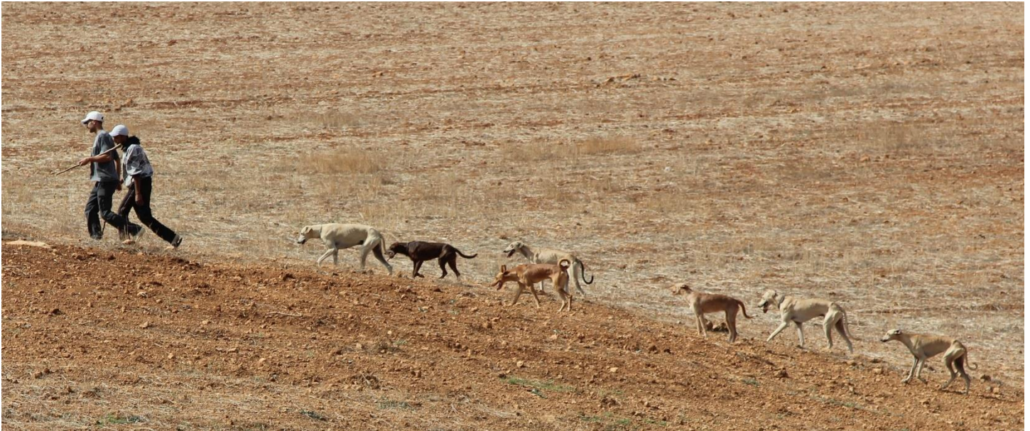
Four Sloughis with their masters, a tracking Braque and two tracking Rateros in Algeria, North Africa (Rateros are a Podenco type, Braque a Pointer type)