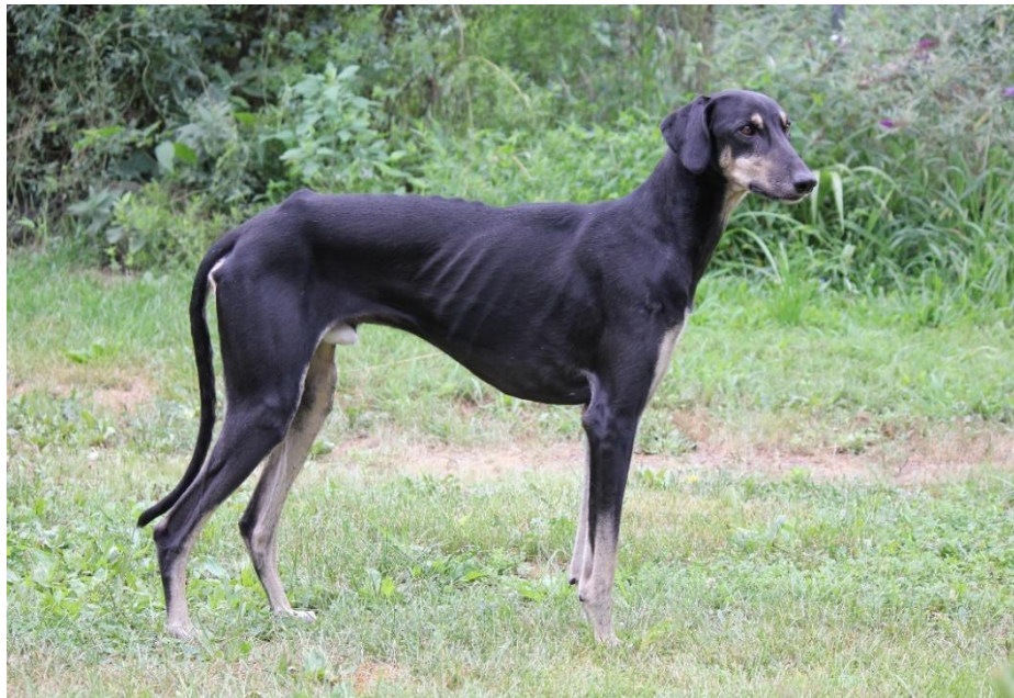
Male Sloughi showing the correct lean muscles of the breed as well as a rare combination of most of the black markings of the breed: black mantle, brindle, black mask

From left to right: red brindle/black mask, sand/black mantle, sand/black mask, sand, red sand/black mask, sand/brindle/black mask, sand/dark overlay/black mask