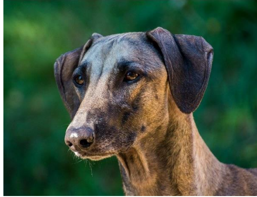
Left: Phareeda Shi'Rayan © de Caprona Right: head seen from \frac{3}{4} , Qalb Elasad Ayda © Liina Niemelä

The characteristics of the Sloughi that make it such an attractive breed are also further highlighted indirectly by what are considered faults or disqualifications in the breed. The FCI standard lists faults as any departure from the foregoing points stated in the standard - the seriousness with which the fault should be regarded to be proportionate to its degree. They are listed as follows: Bad ratio between length of body and height at withers, head and body slightly too heavy, stop too pronounced or not enough, eyes too light, top line not horizontal, croup narrow, too or insufficiently oblique, belly not enough tucked up, rounded ribs, chest not long enough, seen from the side cut up or very arched, tail too short, with too much hair, badly carried, muscles roundish and protruding, hair hard and coarse, small white mark on chest.