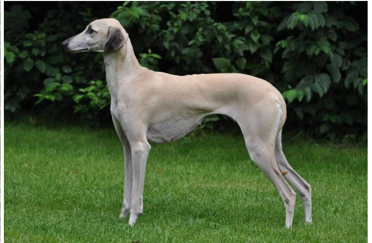
Classic moderate Sloughis of recent African lineage (Tunisian, Algerian and Moroccan) with correct silhouettes

Bitches are allowed a little additional length of body, as with other breeds too Left © de Caprona, right © Marcus Arndt (Germany)