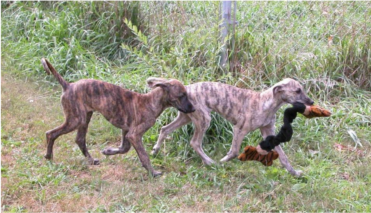
Sloughi Puppies are, from early on, sound movers.

The Sloughi's head appears at first as relatively wide, particularly in males. This good width of skull is coupled with similar lengths of skull and muzzle, with a slight stop. Seen from the side, the head is longish, refined, delicate but rather strong. Seen from above, it has the shape of a long wedge, the skull being the widest part, tapering to the tip of the nose. Between the ears, the skull measures about 4-6 inches (12-14 cm). The skull is distinctly rounded at the back and curving harmoniously on the sides. The nose is black with thin and supple lips just covering the lower jaw and the corner of the mouth is to be barely noticeable. The Sloughi's scissor bite shows normal teeth set on strong jaws. The AKC standard adds a level bite. Strong dewlaps and flews are to be avoided.