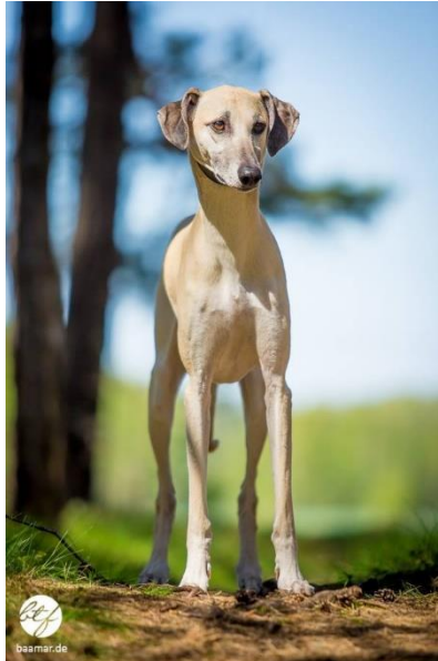
Classic moderate Sloughia of recent African lineage (Algerian and Moroccan) Correct head, front and rear.