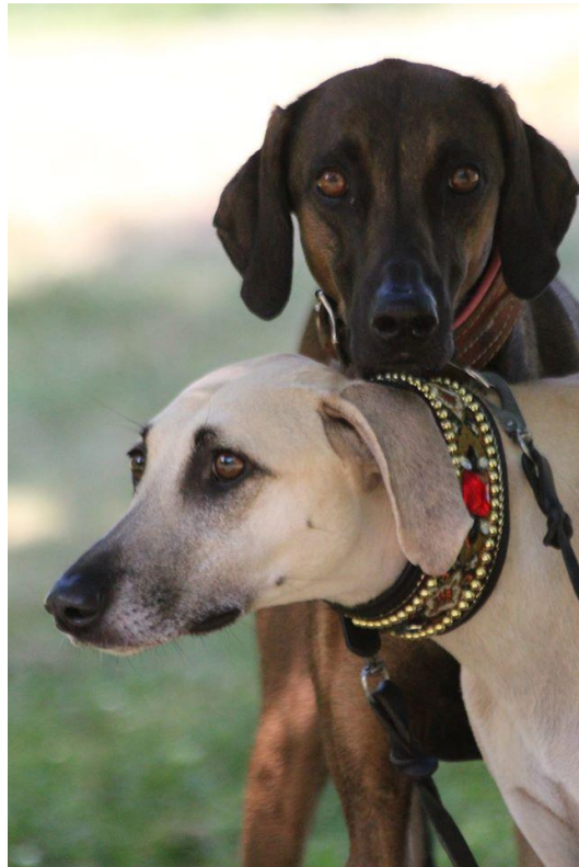
Variations of fawn, from mahogany red fawn to light sand © Chaouki (Finland) Elegantin Magma and V'Hibba Shi'Rayan

On the move, the Sloughi appears effortless, feather light and covers ground without excessive reach and drive. His back stays level while he trots. The tail, with its typical upward curve, is to be carried no higher than the back, although the AKC standard accepts the upward curve reaching above the line of the back when the animal is excited. Puppies and Juniors are fleet of foot too.