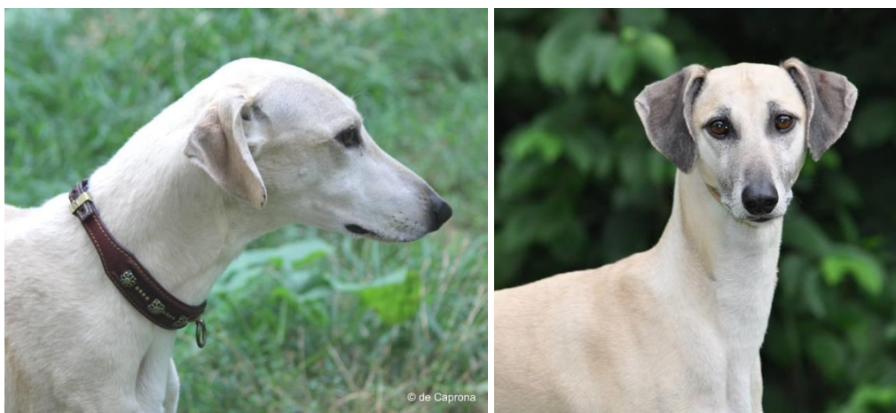
Bensekrane's Saff and V'Hadiyyah Shi'Rayan Left: Correct planes of skull and bridge of muzzle in relationship to each other Right: Proportions of the Sloughi head seen from the front

The expression of the large brown eyes is alert, gentle and slightly melancholy. Their color are shades of amber in light coats to dark brown, eye rims being pigmented.