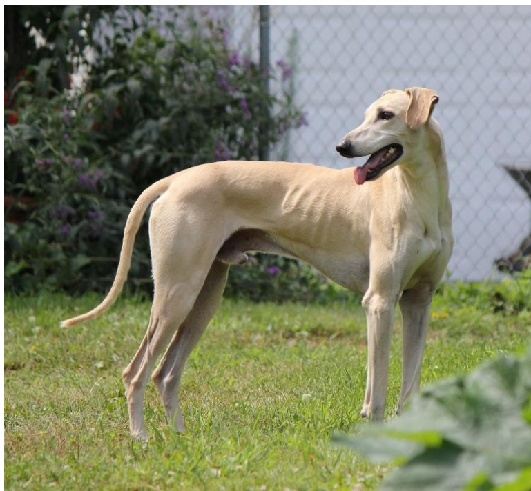
Bensekrane's Saff, country of origin Algerian Sloughi

It has been adjusted to reflect part of the Sloughi history in Finland