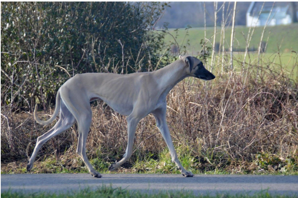
Correct natural gait of the Sloughi, multi Ch. Malala Schuru-esch-Schams, FCI Eurosighthound 2016

On the move, the Sloughi appears effortless, feather light and covers ground without excessive reach and drive. His back stays level while he trots. The tail, with its typical upward curve, is to be carried no higher than the back, although the AKC standard accepts the upward curve reaching above the line of the back when the animal is excited. Puppies and Juniors are fleet of foot too.