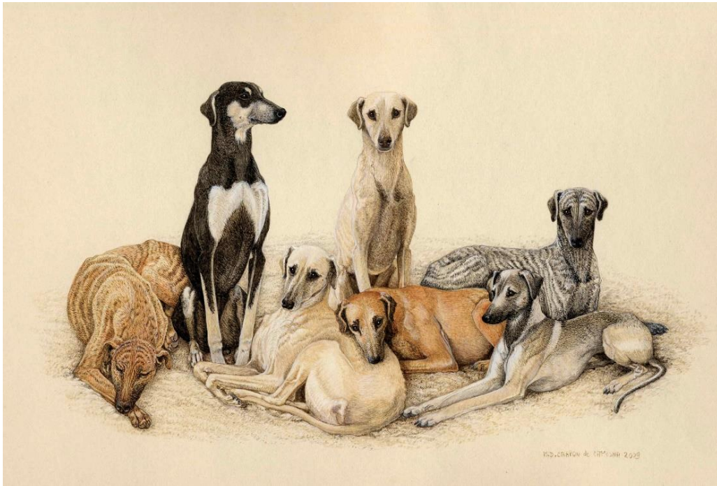
Some of the Sloughi's coat colors. "The Nap" Tempera by the author.

From left to right: red brindle/black mask, sand/black mantle, sand/black mask, sand, red sand/black mask, sand/brindle/black mask, sand/dark overlay/black mask